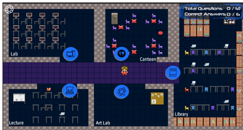
Figure 1: Screenshot of the map of the game

Designed as an interactive quiz experience, UniGame aims to strengthen the knowledge and comprehension of Databases subject among university students. The Database course is a mandatory component of the curriculum. The game presents a virtual university environment where players freely navigate through different rooms as shown in Figure 1, asking a task to the user. When the task is completed, a quiz question related to Databases is showing up in Greek. Greek is selected as the native language of the students for better comprehension. Since feedback is an essential characteristic of the learning process, a positive or negative feedback is given, based on the answer given for the specific quiz question. Figure 2 depicts the positive feedback provided when players select the correct answer. The primary objective of the game is to collect valuable behavioural data in order to model the learner's personality. The game gathers additional data regarding the learning process and student responses to the game questions. Future data analysis took place to assess whether the gathered data are sufficient to provide meaningful insights about user personality traits. The data gathering is restricted to two personality traits: Extraversion and Openness to Experience. The data collected from the game regarding the Databases course can be analysed to identify patterns in student responses and areas of weakness.