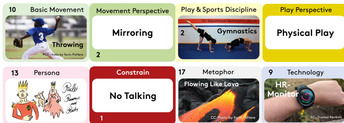
Figure 1: Examples of the MeCaMInD Movement-Modifiers

The development of the Movement-Modifier cards is grounded in sports and health theory and further informed by analogue tools that provoke divergent thinking and core design knowledge like https://innovation.sites.ku.dk/metode/inspirationskort/ , (2023). Movement-Modifiers contain one or a few words or images that aim to provoke, tweak, or inspire generative design activities. The cards relate to knowledge, theory, and practical movement concepts in the domain of sport, technology, games, plays, and movement practices.