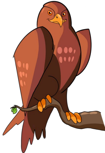
Figure 1: Falchetto, the reading domain's guide character

In particular, the story behind Tachistoscopio is the following: Falchetto, which is responsible for the collection and safeguard of the letters in the game world, is worried because a messy anteater has gone into his nest and has caused them to flee. The player is thus required to read words before they disappear, "capturing" the fugitive letters. It is worthy to note that these characters appear in other ESSENCE games as well.