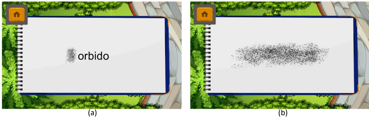
Figure 2: (a) Letter-by-letter and (b) global cancellation of words