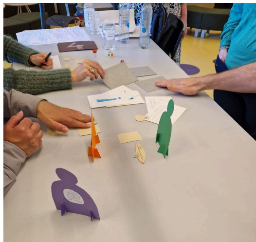
Figure 2: Playtesting of group 3's prototype

Playtesting: In this phase Group 3 enacted play testers for Group 1 and vice versa. In the beginning of the playtest, the group discussed how the title of the game 'The pension battle' provided a stage for an interesting narrative in the game. The two members from Group 3 were given the roles of the divorced couple, while the issue expert in insurance from Group 1 played the counselor who frequently presented new cue cards and regulations for the divorced couple to act upon. The fact that the roles and effects (car, house, summerhouse, etc.) (see figure 1) were explicitly explained and materialised, made the prototype accessible for playtesting. The play testers clearly identified with the characters and enacted the roles of a divorced couple fighting using the materials on the table (see figure 2).