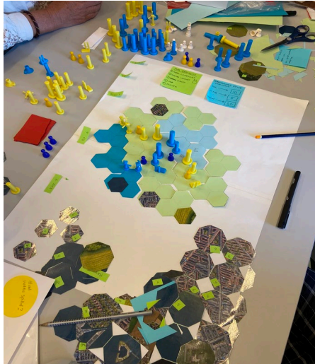
Figure 4: This image shows how the group is leaving behind their original octagonal shaped game prototype idea (at the bottom) in favour of hexagonal shapes (at the top)

Playtesting: During the playtesting phase, the participants and facilitators focused on the game cards, which involved quiz questions for the students - e.g., on how to calculate effect or understand differences between direct current and alternating current. These questions were clearly relevant for the science curriculum, but they had no direct links to the player's actions and mechanics in the game. After discussing this lack of meaningful link between quiz questions and game actions, the group decided to drop the exogenous game elements (Squire, 2006) by removing the question cards from the game and instead focus more on the procedural learning that could result from playing the game and working with different types of energy supply.