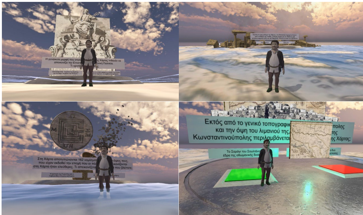
Figure 5: Rigas in front of some puzzle questions

All the above were combined into a single project so as to have access to all twelve questions in a game primarily built for Windows 10 devices but also compatible with Android devices. All questions and answers derived from the provided educational material and by examining and exploring the original Charta. Through this innovative educational activity, the students managed to build a 3D ‘escape room’ with various trigger points in a digital environment, experiencing the game developing production process from start to finish while producing a short serious game inspired by Rigas’ life. (Figure 5)