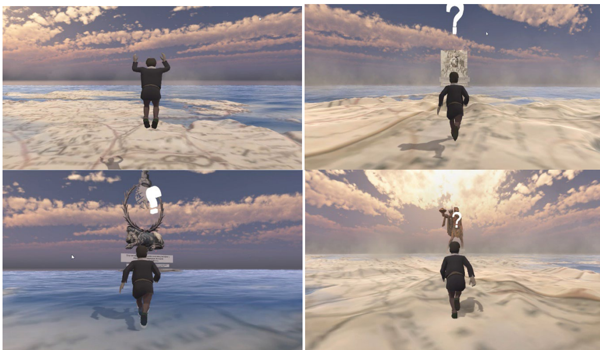
Figure 2: Screenshots from the 3D video game “Hack the Map: Escaping your destiny through Rigas’ Charta”

You must help Rigas escape! Run through the map amongst ancient monuments, historical battles, and mythological heroes, find the secret symbols and solve the riddles to piece together the 12 sheets of the Charta. Live the adventure, face your destiny, and join the pieces of the puzzle in order to win. Learn the heroic life story of Rigas through an exciting time travel.”