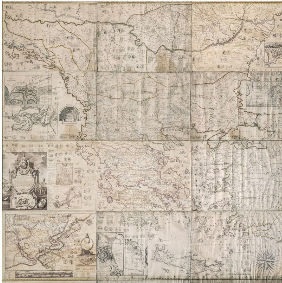
Figure 1: Rigas' Charta of Greece, 2x2 meters, 12 map-sheets, Vienna, 1796–1797