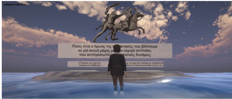
Figure 4: Heracles and the Amazon, source: Hack the Map video game, photo: Kostas Diamantis

All the above were combined into a single project so as to have access to all twelve questions in a game primarily built for Windows 10 devices but also compatible with Android devices. All questions and answers derived from the provided educational material and by examining and exploring the original Charta. Through this innovative educational activity, the students managed to build a 3D ‘escape room’ with various trigger points in a digital environment, experiencing the game developing production process from start to finish while producing a short serious game inspired by Rigas’ life. (Figure 5)