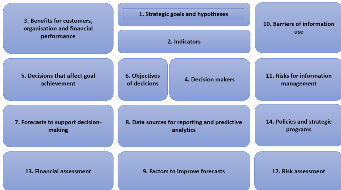
Figure 3: Hypothesis canvas model used for information needs.

Based on the workshops results, the organization started planning the KMS so that it makes information available at the right time to the right person. The workshops helped to break organizational silos and fostered multi-professional dialog. At the beginning of the workshops, the various service areas of the organization posed service-oriented challenges and information needs, but as the workshops progressed, they also found common denominators for the themes to be addressed. The workshops strengthened not only the dialog related to individual information needs but also around KM more generally. Central to this method was to summarize the issues related to the development work and the achievement of the organizations' goals in one page of plain language, which contributes to facilitating communication between management, health and social care professionals, and IT to accelerate KMS design. Also, the hypothesis-canvas supported the discussion related to goal setting and performance.