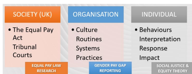
Figure 1: Schema-view of pay inequity research.

The author provides a diagram or schema view of the research landscape (Figure 1) to support the readers understanding of how research currently falls into the three main perspectives (societal, organisational and individual).