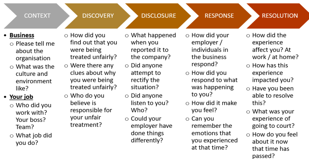
Figure 4: Interview Question Framework: Pay Inequity phases linked to interview questions.

In order to address the perspective (women) and theoretical (lived experience) gaps that have emerged from the literature review, this study has been designed to capture the narratives of women who discovered that they were being paid unfairly. A qualitative approach supports the data collection activities through the use of semi-structured interviews; which will provide a rich narrative of the lived experience of female pay inequity victims. This data capture includes narratives which describe how and when the pay inequity was initially discovered, what happened once this was disclosed to the business, and any responses they observed in themselves and others throughout their experience. Finally questions about the impact that the experience has had, and continues to have, on these women's lives and careers will help to provide insight into the female perspective on this phenomenon, and how such experiences can reshape our thoughts, attitudes, and behaviours towards society, the organisation and other individuals. A summary of the interview questions framework is included as Figure 4.