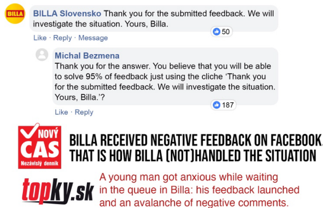
Figure 2: Answering using 'cliché'

now. 1 But users saw no results of such communication. The hate went further and further, leaked from the Internet environment, and was caught by mass media. One comment on social media in combination with not-handled community management presents a serious threat to brands' reputation.