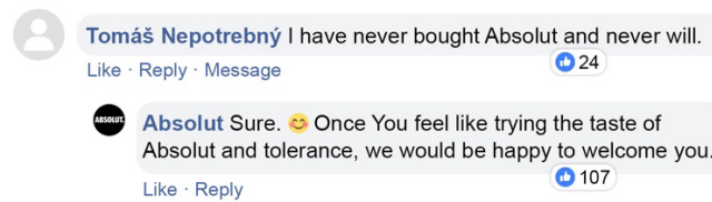
Figure 4: Closure of the discussion

The brand, however, confronted all the comments exquisitely well, stood up a stable position, used thoughtful arguments, and did insult no one. Of course, the brand did not write the words of gratitude for the racism, but in most cases, the brand expressed the argument and demonstrated that, in case the user changes his mind, he is more than welcome to be a customer. With that, the conversation was over, the conflict was solved. The user had nothing to add.