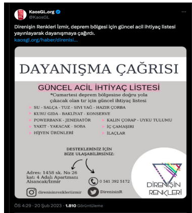
Figure 3: A tweet from Kaos GL (February 20, 2023) highlighted the Colors of Resistance Izmir, current emergency needs list for the earthquake region, emphasizing the urgent needs of LGBTQ+ individuals affected by the earthquake (Kaos GL, 2023).

Here are some examples of social media posts that, along with the interview data, contributed to the emergence of this theme.