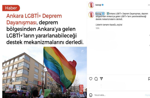
Figure 2: An Instagram post from Kaos GL (February 22, 2023) highlighted the Ankara LGBTI+ earthquake solidarity, compiling support mechanisms for LGBTQ+ individuals coming from the earthquake region to Ankara, emphasizing the importance of support networks and visibility (Kaos GL, 2023).

Another social media post from Kaos GL (February 22, 2023) highlights Ankara LGBTI+ Earthquake Solidarity , an initiative designed to assist LGBTQ+ individuals who relocated to Ankara following the earthquake. Featuring an image of a rainbow flag being held in a public space, the post not only documents the collective response but also visually reinforces resilience and community visibility. This post also provides a curated list of support mechanisms, further emphasizing the role of social media in sharing vital information and facilitating access to aid.