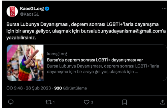
Figure 1: A tweet from Kaos GL (February 28, 2023) announced the formation of Bursa Lubunya Dayanışması, a solidarity initiative for LGBTQ+ individuals after the earthquake (Kaos GL, 2023).

media content further supports this analysis. A tweet from Kaos GL (February 28, 2023) announced the formation of Bursa Lubunya Dayanışması , a solidarity initiative created to support LGBTQ+ individuals after the earthquake. This tweet exemplifies how social media acted as a tool for mobilizing support, demonstrating that online platforms were crucial in organizing aid and creating safe spaces. By providing an email contact, the post also reflects the importance of digital networks in establishing resources and fostering connections among affected individuals.