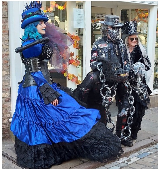
Figure 2: Participants at the October 2021 Whitby Goth Weekend taking part in performance and co-creation