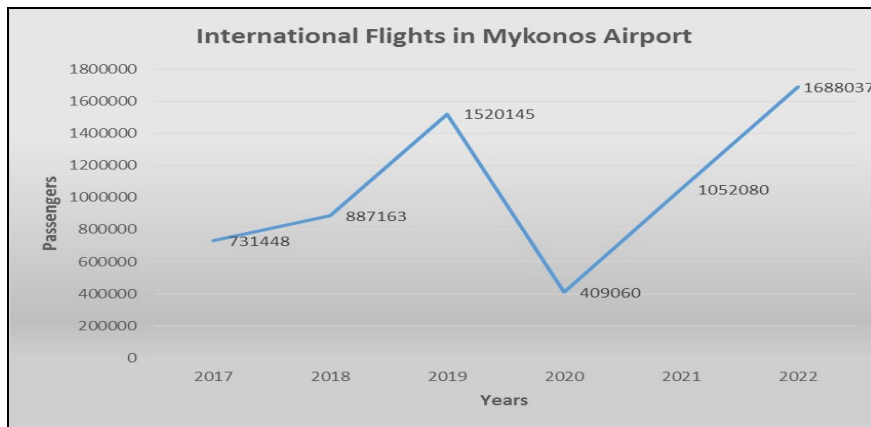
Figure 2: Passengers in Mykonos Airport per Year (2017 – 2022).

As a result, according to the Traffic Report of Mykonos Airport (Figure 2) the number of international flights has been increasing during the past 6 years (Jmk-airport, 2023); besides, most passengers visited Mykonos airport in 2022 (1,688,037 visitors), while fewer passengers (409,060) visited Mykonos on 2020. This is justified by the fact that Corona – Virus (Covid-19) pandemic broken out and measures, such as lockdowns, were enforced in all countries worldwide (Belias and Trihas, 2022a; Belias and Trihas, 2022b; Belias and Trihas 2022c; Ntalakos et al., 2022a; Ntalakos et al., 2022b).