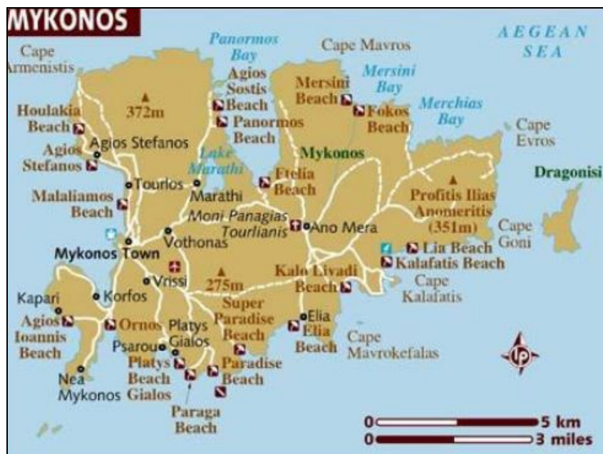
Figure 1: Mykonos Island Map.

Mykonos Island is widely known as the island of the winds and it is located in the heart of the Cyclades group (Figure 1). Mykonos is considered to be one of the most touristic islands of Greece. The total surface of Mykonos island area is 105.5 km 2 and the length of its coastline is 89 km. The permanent population of Mykonos was 9,802 inhabitants according to the last census in 2021 (Municipality of Mykonos, 2023). Unfortunately, the inhabitants of Mykonos were 3.3% reduced in comparison with the previous census in 2011 (10,134 permanent inhabitants), despite the fact that Mykonos was estimated to have 12,675 inhabitants in 2021 (Municipality of Mykonos, 2023). This phenomenon can be explained since Mykonos is a tourism destination that is fully providing hospitality and tourism services during the spring and summer periods (April - October). All the other months, most of the hospitality companies (hotels, bars, restaurants, beach bars, and activities) are closed. As a result, many inhabitants stay unemployed for several months. This phenomenon has led the permanent inhabitants (especially the younger ones) to move to the urban centers in order to seek a permanent job (MykonosSticker, 2021).