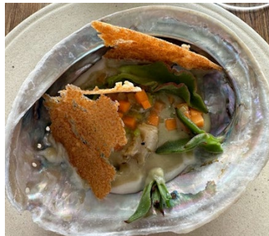
Figure 3: Abalone, mieliepap and brakslaai