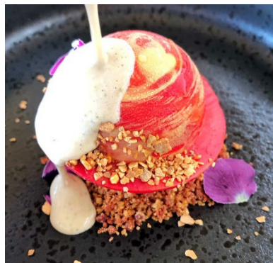
Figure 13: a chocolate sphere with poached guava and a nutmeg pelargonium custard

Leg 6: The Sustainability Institute outside Stellenbosch was our last destination. Their canteen, The Green Café, offers an indigenous salad featuring wild rosemary, wild sage, sunrose ( Aptenia cordifolia ) and spekboom (Figure 14). The kitchen gardens of Spier Wine Farm supplies produce like waterblommetjies (Figure 15) to various eateries on the estate.