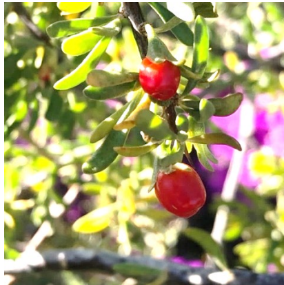
Figure 9: Lycium cinereum (Kriedoring)

Dinner was Afrikaner heritage food eaten at the Karoo Kombuis, a restaurant in Prince Albert housed in a small period house of which the front rooms have been converted into a dining room. It offers a distinctly homely feel of Afrikaner culture.