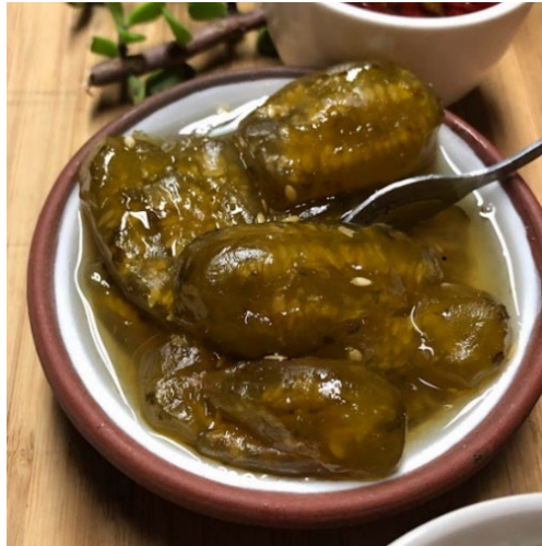
Figure 8: Hoodia gordonii (Bitterghaap) preserve

Leg 4: The day was spent in Prince Albert. A veld tour by indigenous veld experts introduced us to the flora of this specific area of the Karoo and we sampled many indigenous edibles, such as the tart red berries of the Kriedoring ( Lycium cinereum ) (Figure 9) and Soutslaai or the Common ice plant ( Mesembryanthemum crystallinum ) (Figure 10).