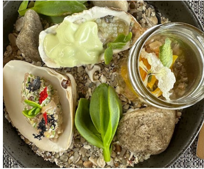
Figure 11: Coastal Canapé: cured Kolstert with sea pumpkin tartare; oyster with dune spinach espuma and lemon pearls; Cape Malay pickled fish, buchu sago and curry oil

Leg 5: A booked lunch at Grootbos Private Nature Reserve showcased many innovative uses of indigenous ingredients and heritage foods. The first course included sea pumpkin ( Prenia vanrensburgii L.Bolus) and kolstert (blacktail) tartare, an espuma of dune spinach and a puffed sago wafer flavoured with buchu, served with Cape Malay pickled fish (Figure 11). The small soup course consisted of a marrow cappuccino with beef tartare on the side and black garlic mayonnaise; the cappuccino was lightly flavoured with Cape Snowbush ( Eriocephalus africanus ). Two courses thereafter featured local elements such as Mountain Sage ( Salvia chamelaeagnea ) with sous vide asparagus, garlic foam and confit yolk, as well as charred trout served with linguine and seaweed caviar. Main course was a braised oxtail kataifi with home-made ketchup and a coastal aniseed buchu ( Agathosma cerefolium ) foam (Figure 12). The dessert was a red chocolate sphere (resembling a planet), filled with canned guavas, a very traditional South African food heritage favourite (Figure 13), revealed when a hot nutmeg pelargonium ( Pelargonium fragrans ) custard was poured over.