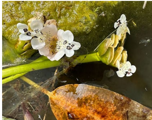
Figure 15: Waterblommetjies at Spier kitchen gardens