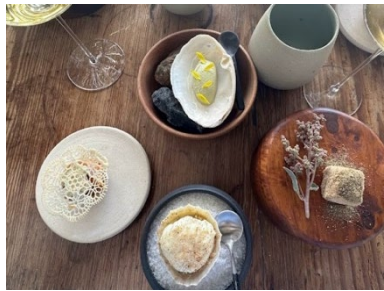
Figure 2: Quartet of starters served after the bread course

Four dishes followed: yellowtail fish with grapefruit, nasturtium and kruipvygie ( Jordaaniella cuprea L.Bolus); a cheese course of frilly Tête de Moine cheese, apple and Saldanha Bay mussels; a Cape Bream and waterblommetjie ( Aponogeton distachyos ) dish (Figure 15); and the first of two dessert courses – a pear poached in Rooibos tea with smoked amasi (a fermented milk product) and a mabele crumble. Ting ya Mabele is a traditional fermented sorghum porridge eaten by Tswana people throughout South Africa and Botswana. The final dessert (Figure 4) reflected South Africans' penchant for canned guavas, served under a meringue dome with a sago pudding made with evaporated milk, garnished with edible flowers. Petit Fours were bars of fried fig and seeds. The meal was paired with local South African wines.