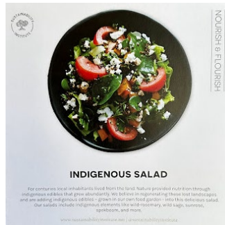
Figure 14: Canteen wall advertisement for an indigenous salad at the Sustainability Institute