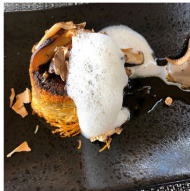
Figure 12: braised oxtail Kataifi with mushrooms, home-made ketchup and buchu foam