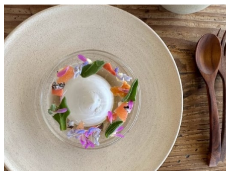
Figure 4: Guava and evaporated milk second dessert

Please note that the researchers own copyright of Figures 2 to 19