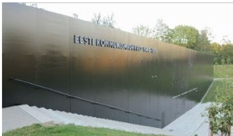
Figure 2: Memorial to the Victims of Communism