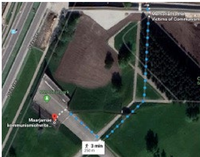
Figure 3: Relative location of the Two Memorials

There has been controversy as to the purpose of such Memorials particularly by countries that continue to be governed within a Communist system such as China and Vietnam (Nordlinger, 2014). From the first announcement that such a Memorial was to be built in Tallinn, and specifically the chosen location, as it was to be located within approximately 500 meters from the Maarjamäe Memorial (see figure 3), there were protests raised in the Russian press, as there was an ongoing concern that Estonia was continuing to equate Nazism and the Soviet Union (Moscow Times, 2015). The concern for the Maarjamäe Memorial was heightened with the building of the Memorial to the Victims of Communism, as there were voices to tear down the former as the latter was being built (Cavegn, 2018).